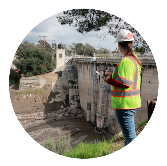
Please visit our website at devilsgateproject.com for additional information about our responsible approach to sediment removal.