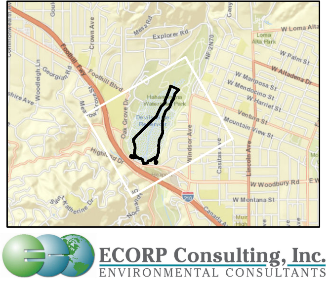
Map Date: 7/29/2020

Service Layer Credits: Sources: Esri, HERE, Garmin, USGS, Intermap, INCREMENT P, NRCan, Esri Japan, METI, Esri China (Hong Kong), Esri Korea, Esri (Thailand), NGCC, (c) OpenStreetMap contributors. and the GIS User Community