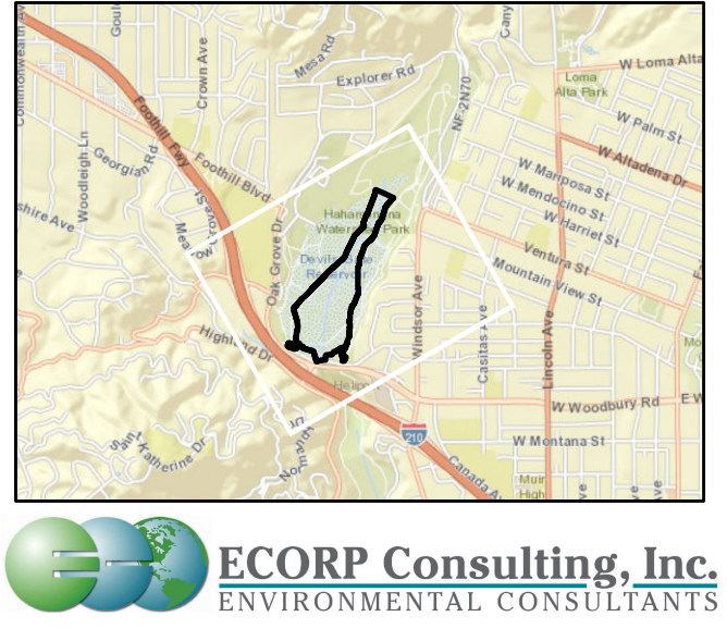
Map Date: 7/29/2020

Service Layer Credits: Sources: Esri, HERE, Garmin, USGS, Intermap, INCREMENT P, NRCan, Esri Japan, METI, Esri China (Hong Kong), Esri Korea, Esri (Thailand), NGCC, (c) OpenStreetMap contributors, and the GIS User Community