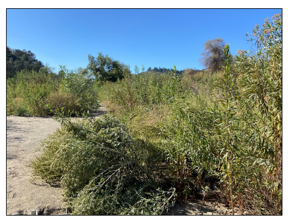
Photo 3: Overview Mitigation Area Overview Mitigation Area DG-2 & DG-2 New Channels