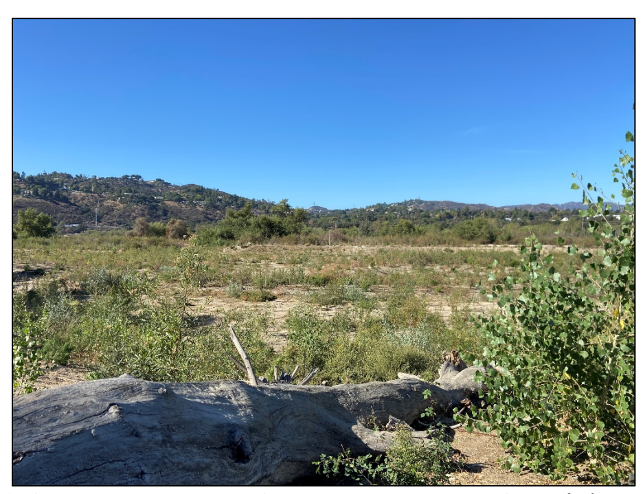
Photo 2: Overview Mitigation Area Overview Mitigation Area DG-W-1 (Johnson Field)