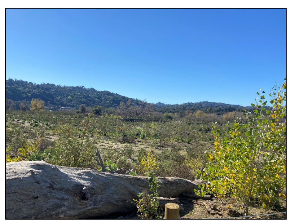
Photo 2: Overview Mitigation Area Overview Mitigation Area DG-W-1 (Johnson Field)