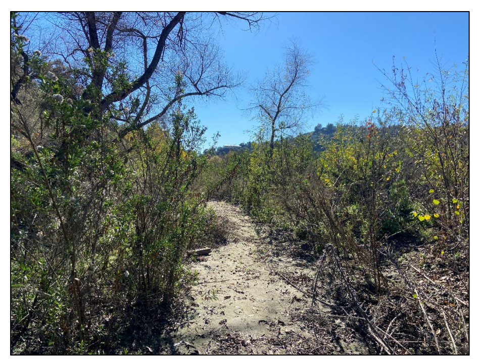
Photo 3: Overview Mitigation Area Overview Mitigation Area DG-2 & DG-2 WOUS