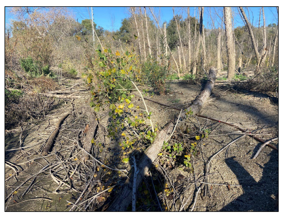
Photo 10: Damage to Container Plants from Woody Debris in Mitigation Area DG-W-2 (Mining Pit)